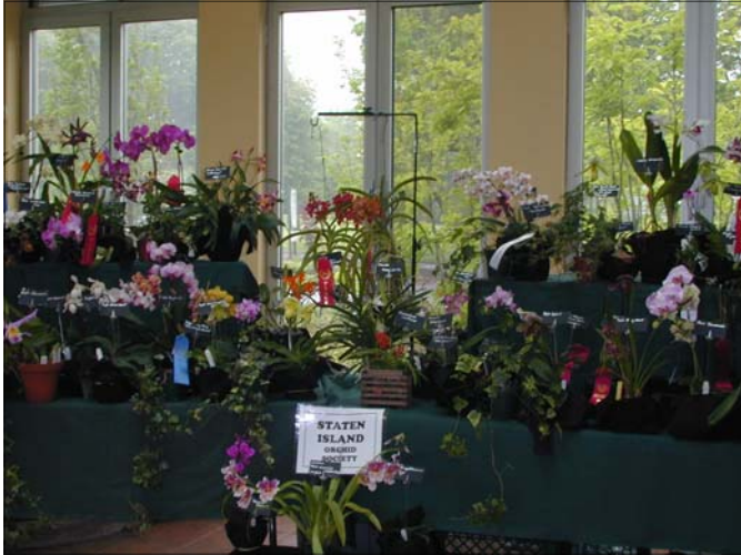
Staten Island Orchid Society Exhibit