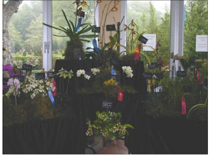
Deep Cut Orchid Society Exhibit