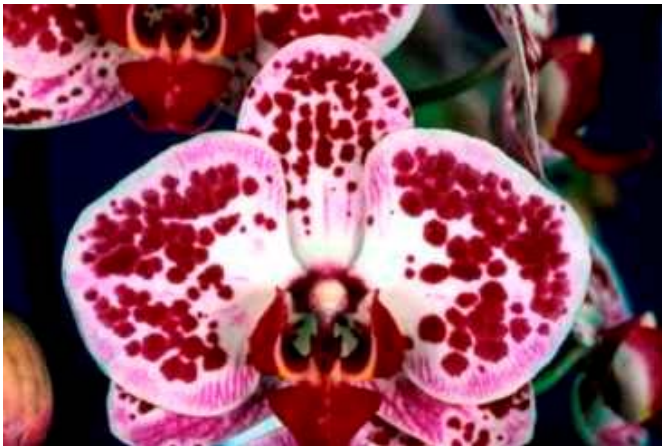
Doritaenopsis Chain Xen Pearl 'Penny', AM/AOS (Ching Hua Spring x Nobby's Pink Lady) Grower: A & P Orchids, Swansea, MA

Winter is in full swing this month and so is the moth orchid ( Phalaenopsis and Doritaenopsis ) flowering season. These brightly colored, easily grown beauties help to take some of the edge off the gloomy winter season. Years ago when I first started growing orchids, Phalaenopsis were sort of like Henry Ford's early cars. You could have any color you wanted as long as it was pink or white (black in the case of the Ford Model A). Today, phalaenopsis hybrids are available in virtually every color of the rainbow, including blue and green and every combination of spots and stripes you can imagine.